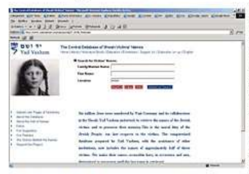
La pagina Web del database delle vittime dell'Olocausto

Il Museo dell'Olocausto mette per la prima volta online le schede biografiche di 3 dei 6 milioni di ebrei uccisi dai nazisti